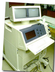
Advanced diagnostic imaging such as ultrasound may be required

To identify the tumor type precisely, it is necessary to examine the tumor itself. This involves exploratory surgery, often with total removal of the tumor. The tissue samples are submitted for microscopic examination by histopathology. Specially prepared and stained tissue sections are made at a specialized laboratory where the slides are examined by a veterinary pathologist.