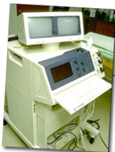
Advanced diagnostic imaging such as ultrasound may be required

Cancer is often suspected from clinical signs. X-rays, ultrasound and MRI (magnetic resonance imaging) or CT (computerized tomography) scans may be useful in detecting the tumors, including metastases.